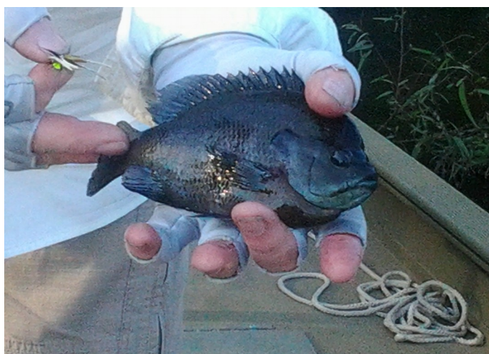
He ain't that big but I don't care.