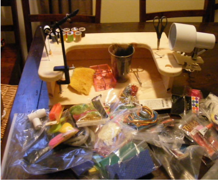
New fly tying station and materials