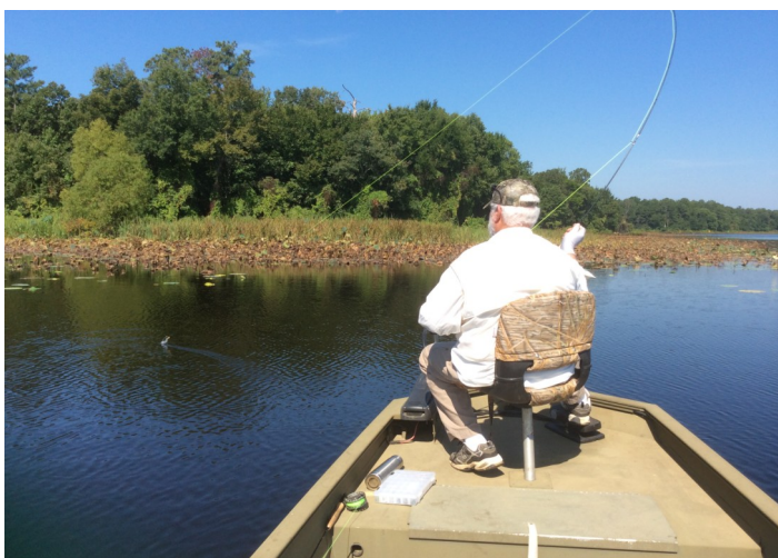
Got the little fat rascal !