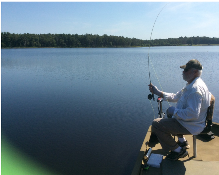
Stalking the wiley Bluegill on Ivan Lake in Bossier Parish, LA.