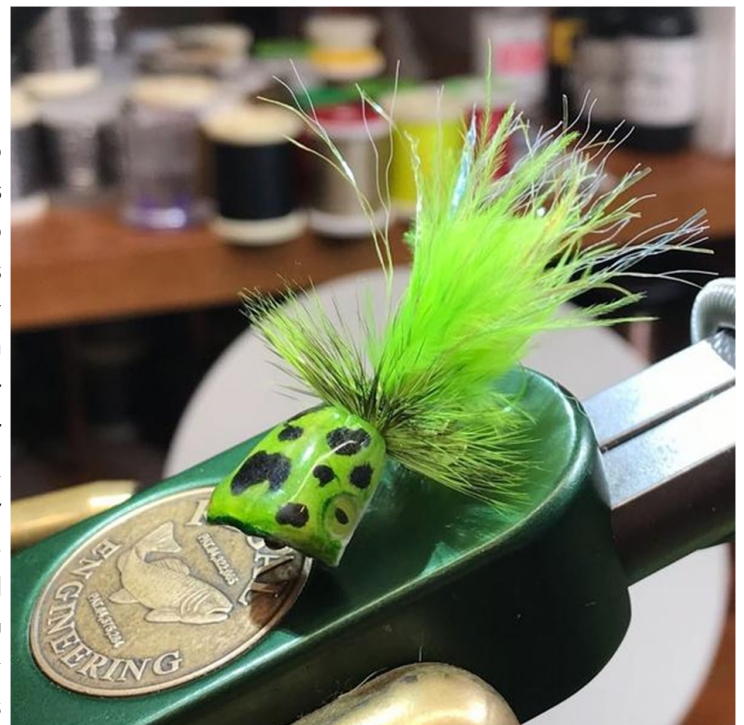
Tying up some Double Barrel poppers. (Continued on page 4)

Once you have somewhere to tie, it is critical to have a well-lit workspace. Give careful consideration to lighting; access to natural sunlight is a bonus, but failing that an artificial light source will do the trick. Daylight spectrum lightbulbs