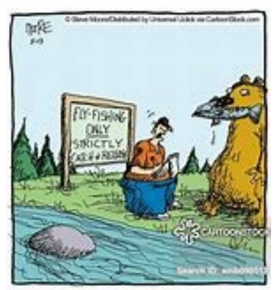
"Sorry, pal. Illiteracy is no excuse for breaking the law."

It is a new year. Hopeful, it is not like 2020. With vaccines becoming available, maybe the second half of this year, we can know what our new normal will be. Wishing and hoping the best for you and your family, this year.