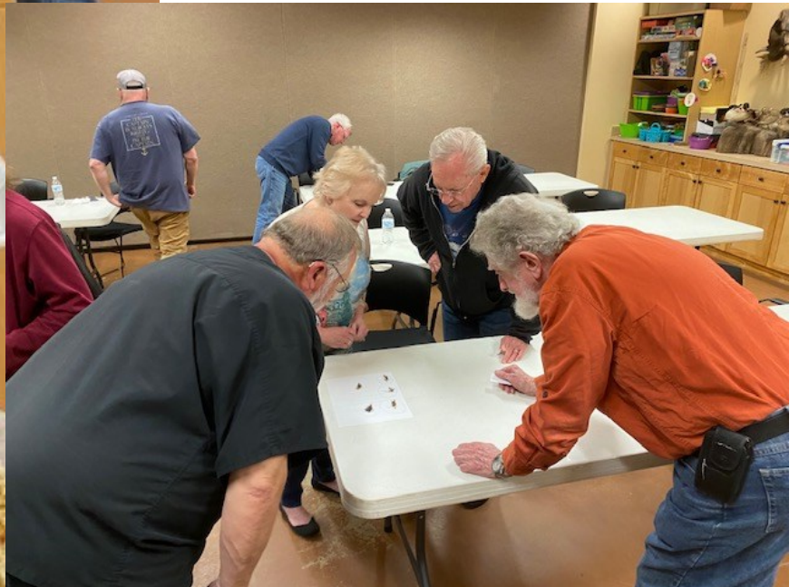
Mystery Fly draws attention at Chili Cookoff!