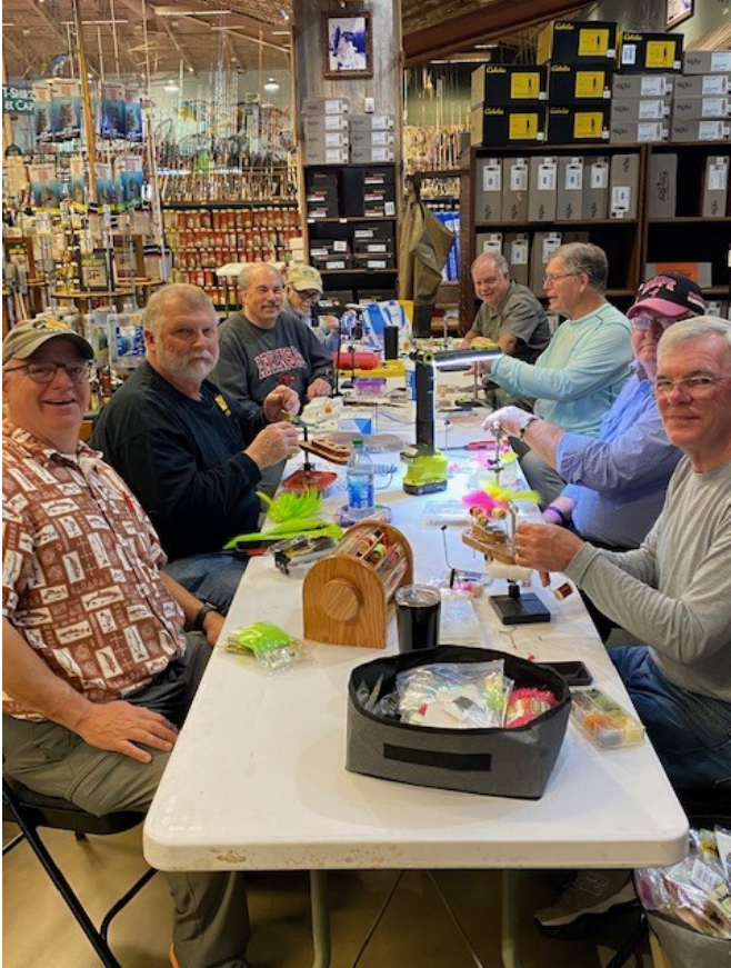
Emergency Nelson Fly Tying Lesson